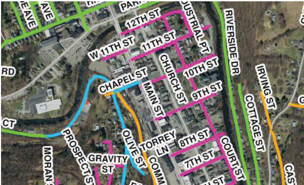
Portion of a map noted above.

Other examples of municipal mapping assistance included providing geospatial data exports to municipalities who were looking to manage certain projects with their own internal mapping applications.