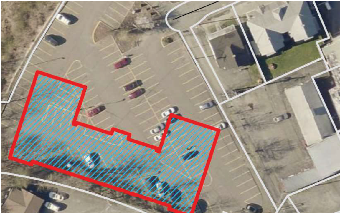
Scale visualization of an apartment building within a Honesdale parking lot.

As part of our County-wide work assisting other offices with mapping resources and project development, this past year, we provided historical aerial photo maps to the Wayne Conservation District showing the boundary of two minor watershed areas in Honesdale Borough and Texas Township, mapped parcels of interest and potential project locations for the Wayne County Commissioners Office, and visualized potential housing placement within an existing parking lot when discussing infill development with Wayne Tomorrow's Housing Task Force, among other engagements.