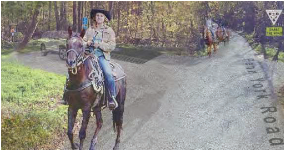
Proposed multi-use road concept in Scott Township. Rendering by Woodland Design.

On behalf of Wayne County, Woodland Design and Associates completed this planning effort in 2022, with mapping and planning support from our office. A very detailed municipal inventory of recreational assets was included in this plan, which stands alone and will also be incorporated into Wayne County’s Comprehensive Plan update (in progress) as a section thereof.