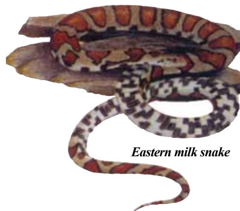
Eastern milk snake

and up to the foundation; c) remove dense ground cover plantings from the foundation area; and d) eliminate potential food sources such as mice, rats, flying squirrels, and voles from the building.