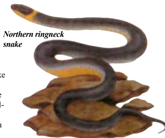
Northern ringneck snake