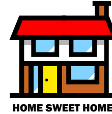
HOME SWEET HOME